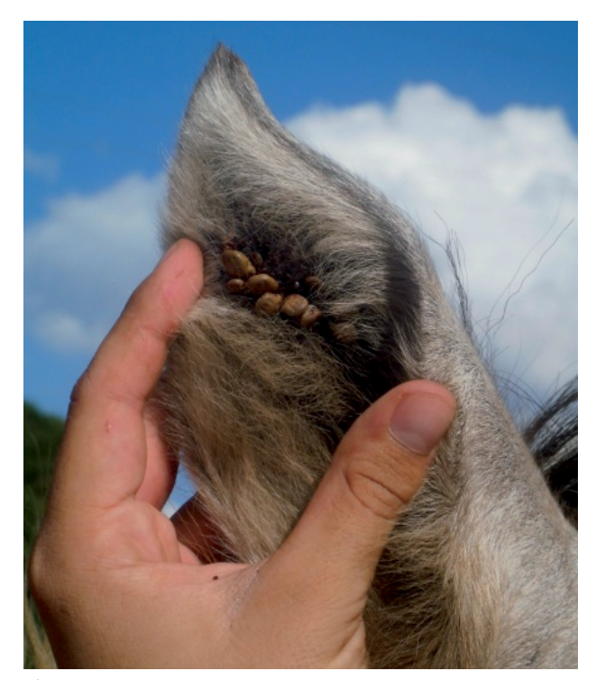
Figure 1. Equine pinna showing ticks' infestation.

It was found 76.16% (131/172) of positive animals when all the animals were grouped and analyzed independently of the property and visit. Property 2 had 88.37% (38/43) of positive animals at IFA test in 1:160 dilution. There was no difference in distribution of positive and negative animals between properties (p=0.0531). There was no difference (p>0.05) in frequency of positive and negative animals between first and second visit in each property.