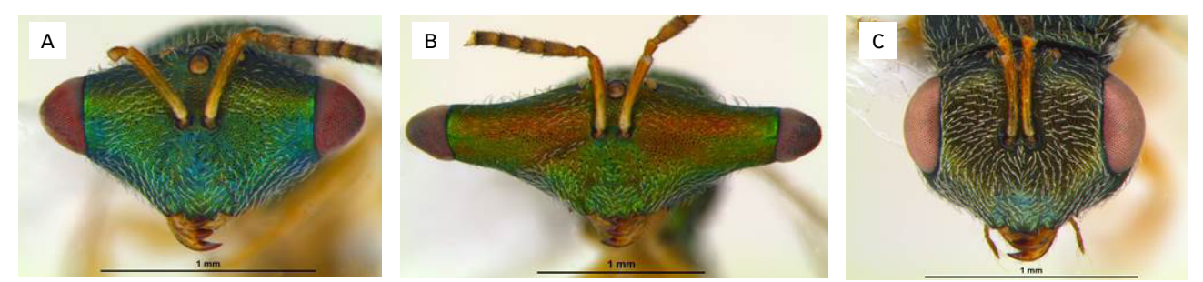
Figure 1. Frontal view of the head of male individuals: (A) ellipsoid-rounded head; (B) ellipsoid-elongated head; and of female individuals (C) belonging to species Jaliscoa nudipennis.

Dimorphism among males may be a determining factor in their competition with females, since males were to first to emerge. According to GODFRAY (1994), gregarious male parasitoids emerging from their hosts tend to mate with their sisters before they get dispersed; thus, mating and competition between siblings are highly likely to happen. However, it is necessary conducting further studies to test this hypothesis.